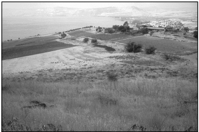
View from hills surrounding Sea of Galilee (at top left of photo).